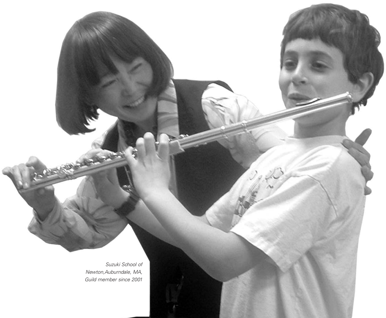
Suzuki School of Newton, Auburndale, MA, Guild member since 2001