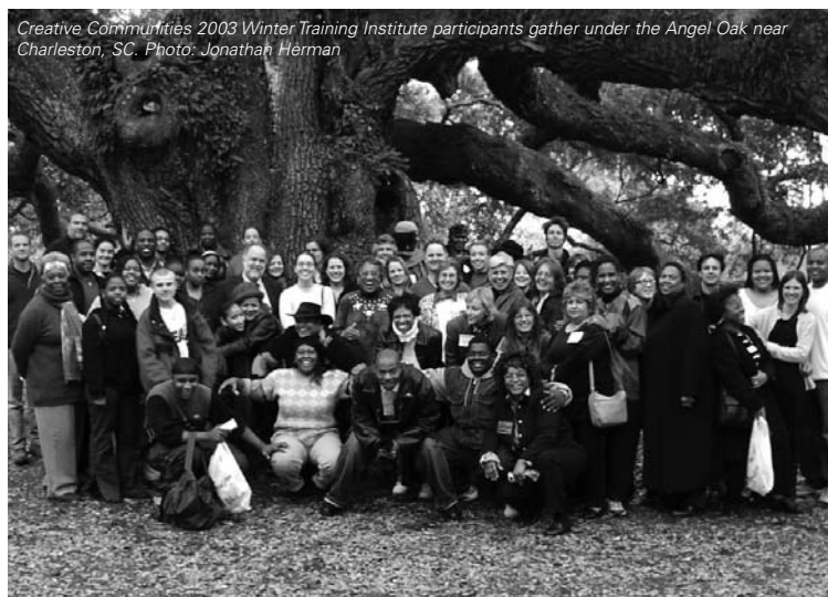
Creative Communities 2003 Winter Training Institute participants gather under the Angel Oak near Charleston, SC.