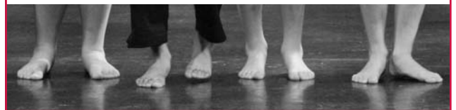
Hochstein School of Music and Dance, Rochester, NY, Guild member since 1961