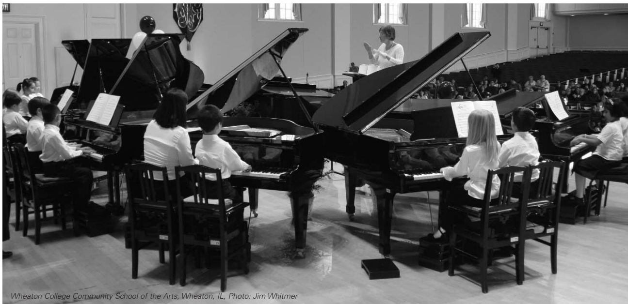
Wheaton College Community School of the Arts, Wheaton, IL