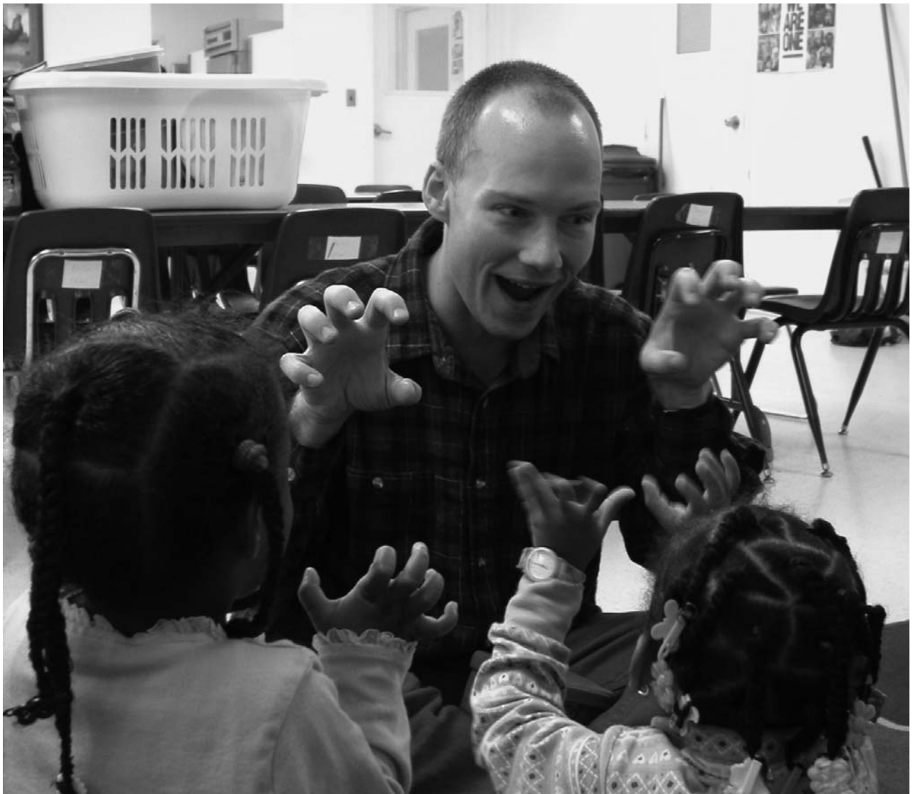
Levine School of Music, Washington, DC, Guild member since 1981